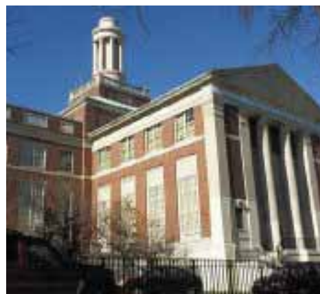
↑ Manhattan Center for Science and Mathematics

state and local government are working together to claim a share of this growing sector. To attract start-up and early-stage life sciences companies, New York City now provides public funding and tax incentives. On the strength of these funding initiatives and incentives, leasing activity in the sector reached an annual high in NYC before the first half of the year. In June, Mayor de Blasio and the New York City Economic Development Corporation announced a further investment of $1 billion in the sector, through a public funding program called LifeSci NYC, which should serve to further advance the growth trend.